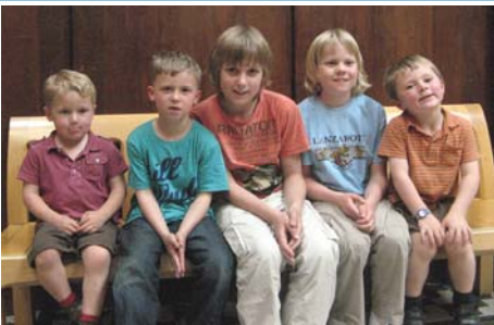
Meeting up with cousins at the Natural History Museum...