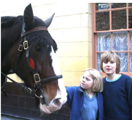
Late sun at Ironbridge, exploring our engineering heritage