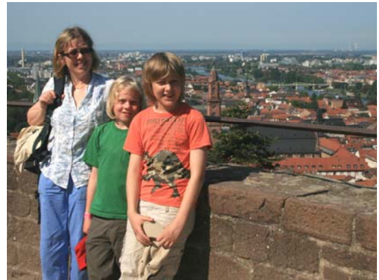
Summer in Germany, exploring castles and a zoo in Heidelberg, and a Natural History Museum (and another zoo) in Stuttgart