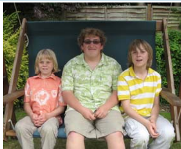
...friends from Seattle