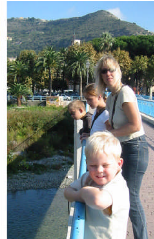
Rain in August, Sunshine in October